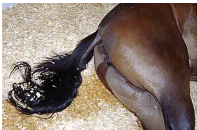
Urine dribbling as well as difficulty in urinating and defecating are also clinical signs of EHM.

Until such time as a vaccine is developed to protect horses from EHM, the best way to prevent the spread of disease is through isolation, quarantine and the practice of biosecurity—a series of management steps taken to prevent the introduction of infectious agents into a herd. All of these preventive measures are discussed in the following sections.